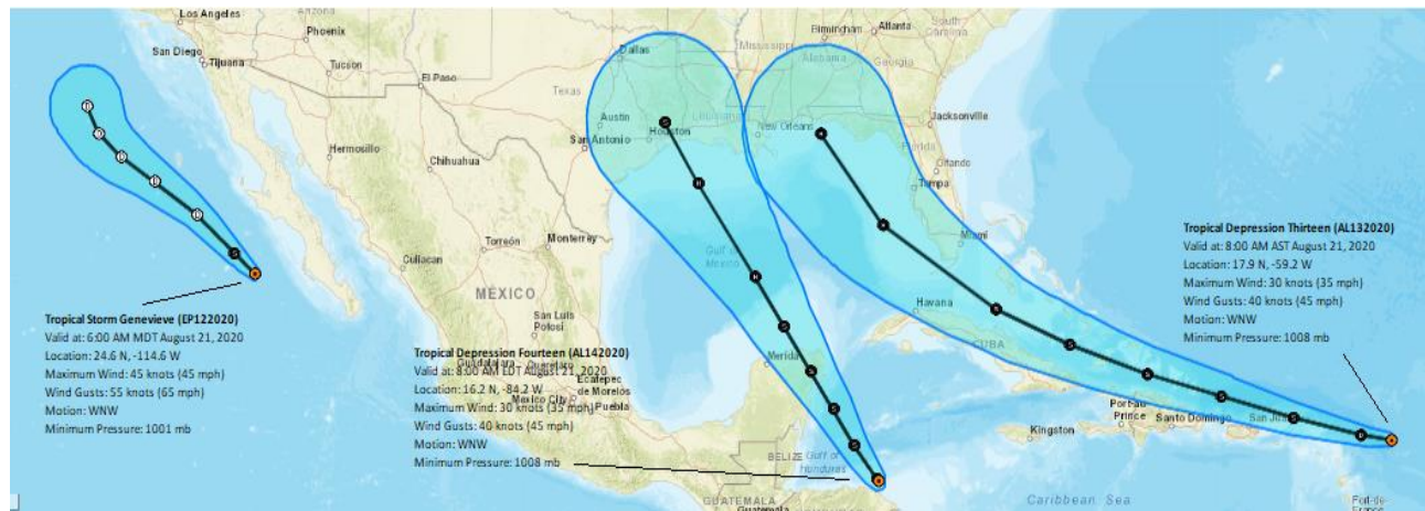
Figure 1 - Skytek overview of heightened hurricane activity in USA waters on 21st Aug 2020

A high level of activity is present in the US gulf, and latest NHC forecast sees tropical depressions thirteen and fourteen getting more organised into tropical storms and then forecasted to intensify into hurricane Laura and hurricane Marco by early next week, threatening a wide swathe of exposed coastline in the Gulf and including Florida.