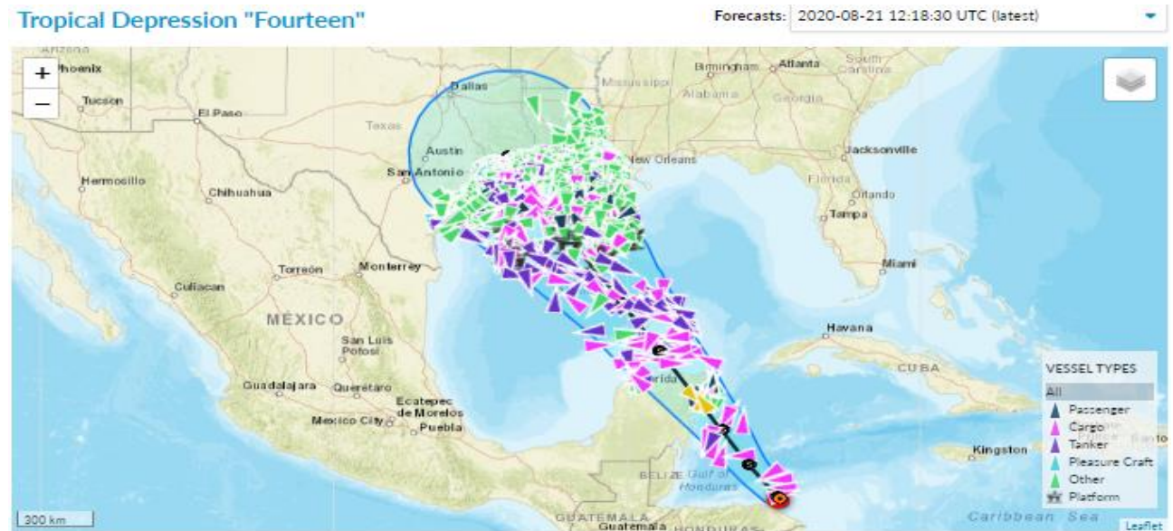
Figure 3 – Skytek capture of marine exposure in the cone of TD Fourteen on 21 st Aug 2020

2. Tropical depression “Fourteen” is expected to intensify into hurricane Marco from Monday 24 th Aug. brushing through the Gulf of Mexico where Skytek tracks 2240 ships, over 880 offshore energy assets and several wind farms.