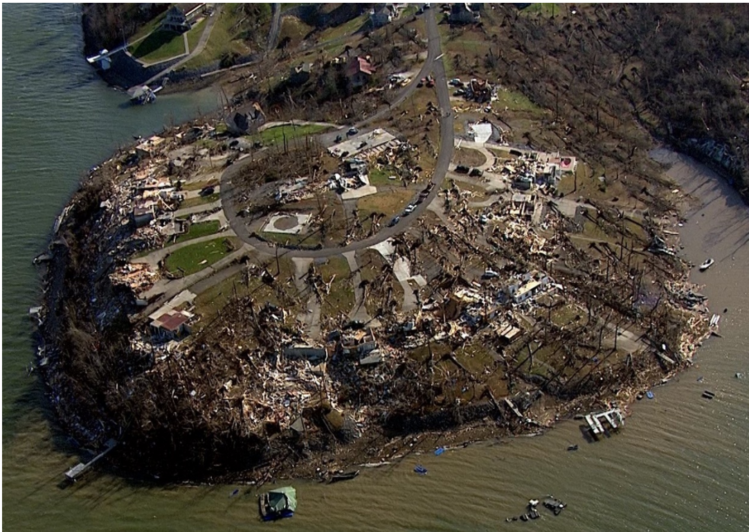
Figure 8 – Drone image of Cambridge Shores, Kentucky on 12 th December 2021