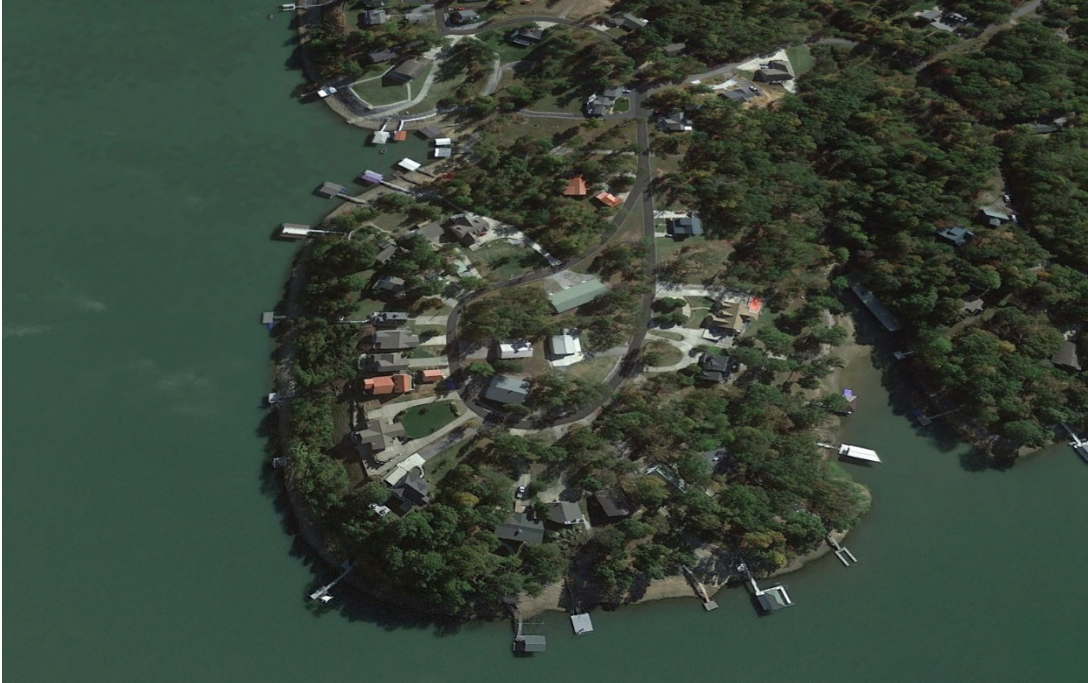
Figure 7 – Drone image of Cambridge Shores, Kentucky on 27 th September 2021