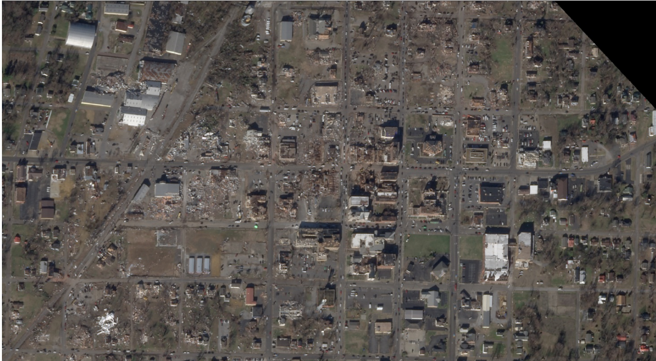
Figure 6 - Amazon Fulfillment Center on 12 th December 2021.