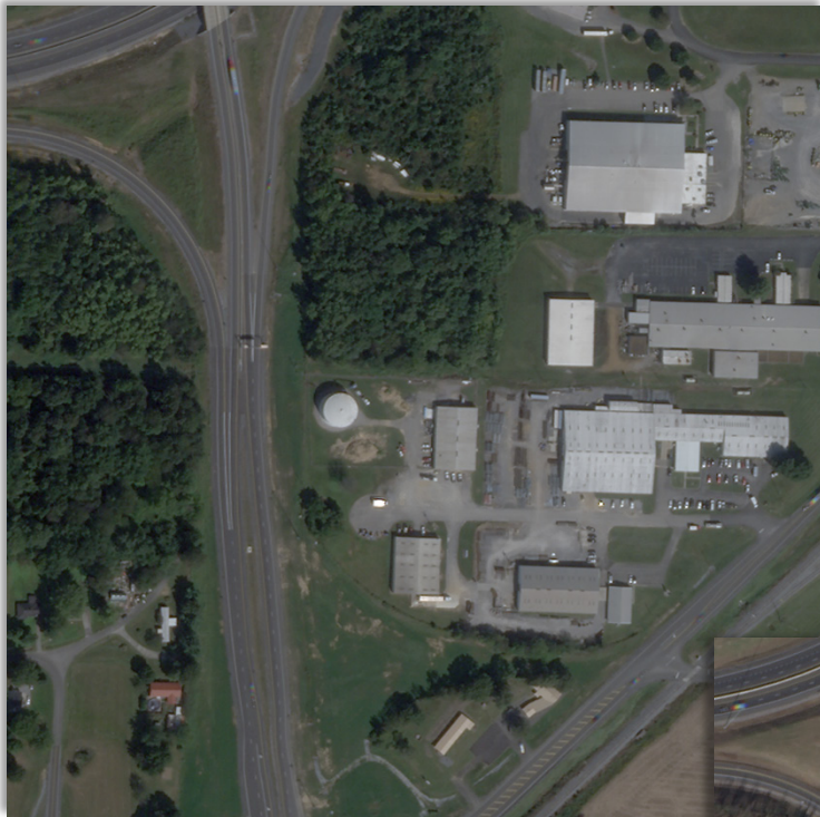
Figure 3 - Mayfield Candle Factory on 27 th September 2021