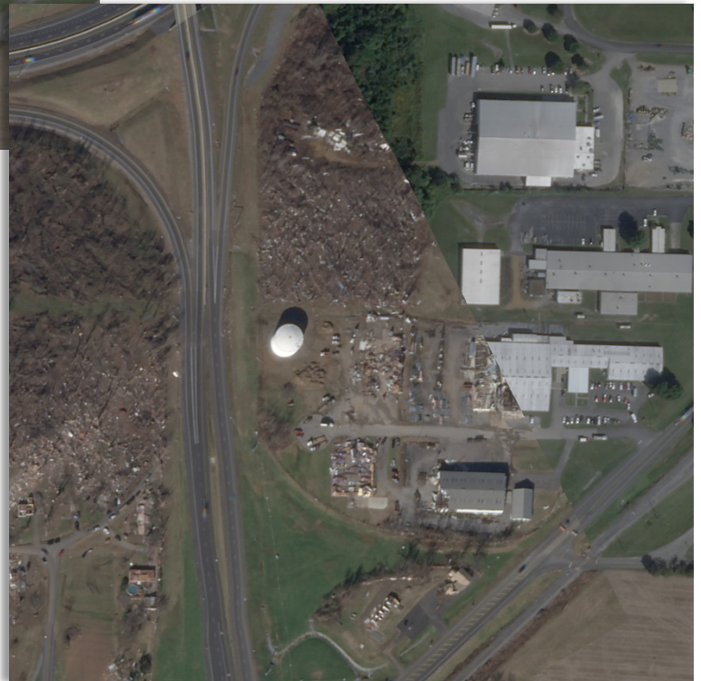
Figure 4 - Mayfield Candle Factory on 12 th December 2021.