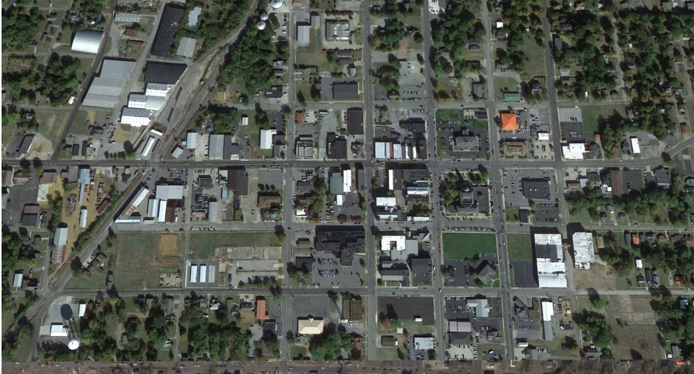
Figure 5 - Amazon Fulfillment Center on 27 th September 2021